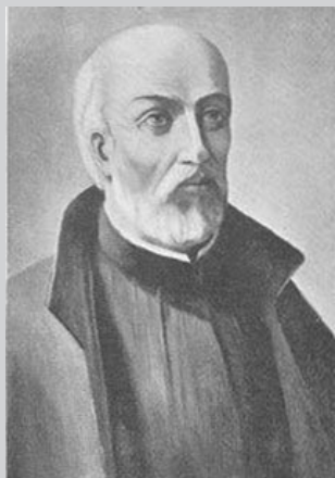
St. John de Brebeuf